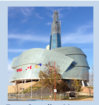
Tour: Canadian Museum for Human Rights

Righting Canada's Wrongs: Residential Schools